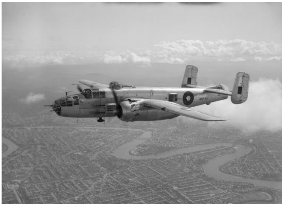
A North American B-25J Mitchell bomber flying over Brisbane.