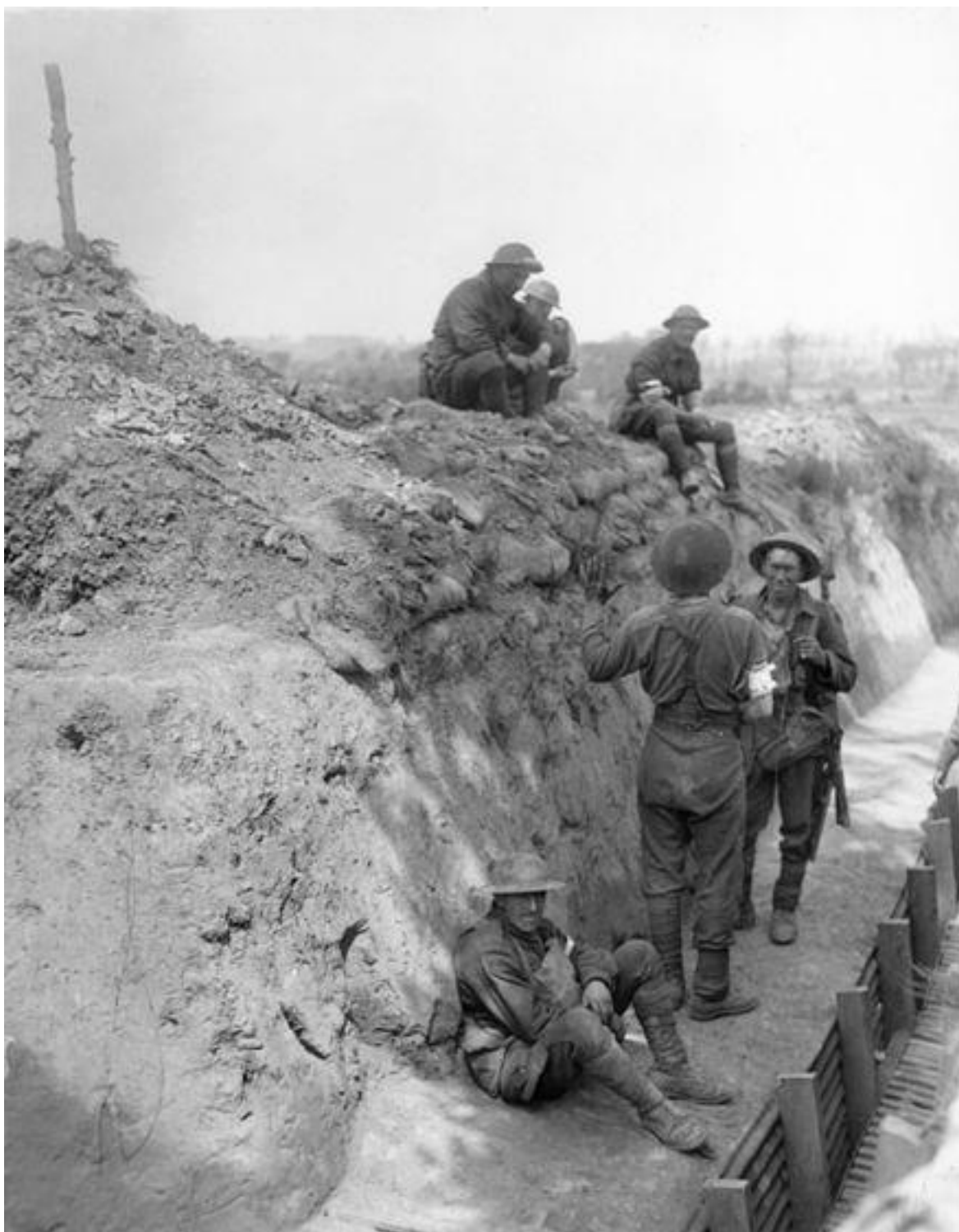
Australian 49 th Battalion, Battle of Messines 7 th June 1917

Anzac Field Dressing Station 7 th June 1917