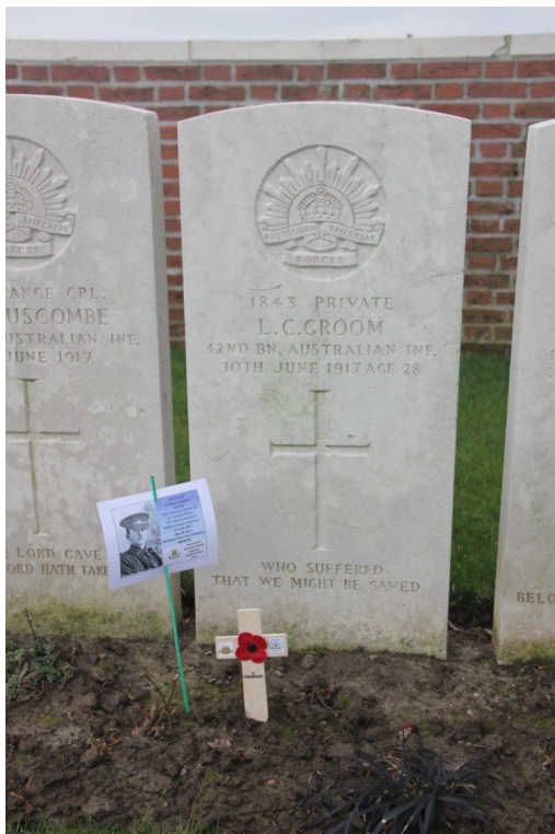
Littleton Campbell Groom's Headstone at Bethlem Farm East Cemetery, Belgium taken in 2015