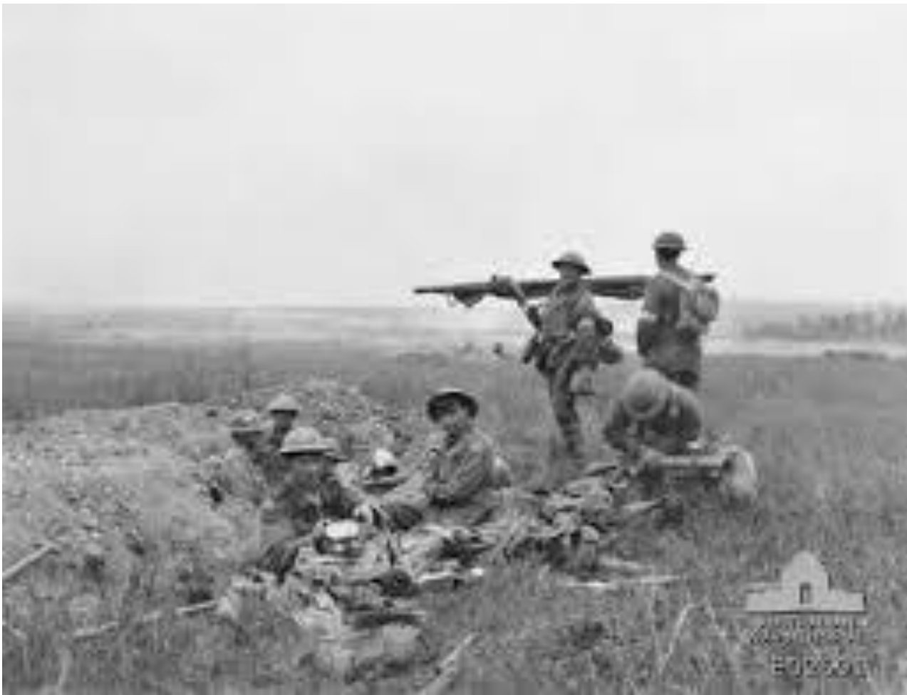
42 nd Battalion in the field

AWM4 AIF unit war diaries 1914-18 war 23/59/8 42nd BN June 1917