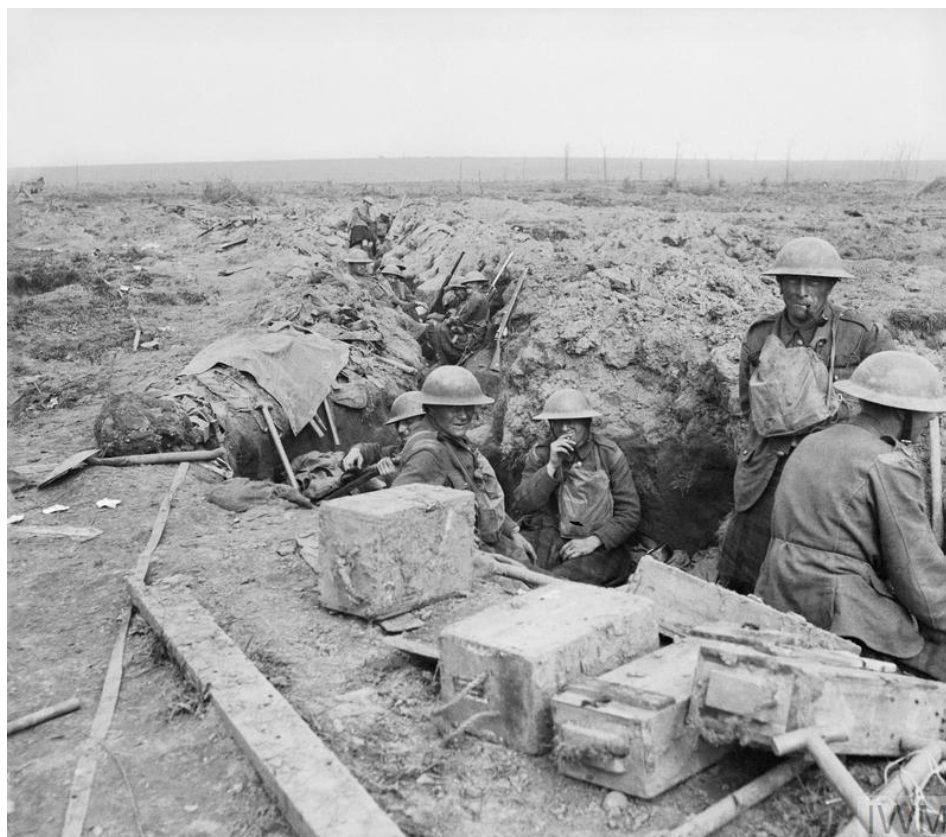
Battle of Menin Road, Belgium