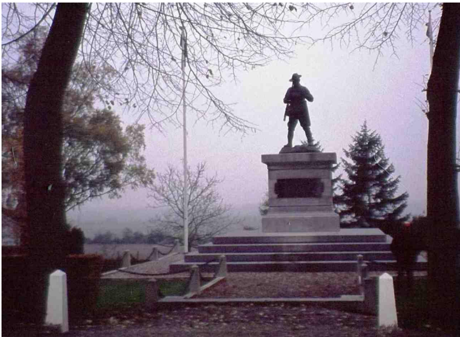
Second Division Memorial at Mont St Quentin

AWM4 AIF unit war diaries 23/43/12 26th BN JULY 1916