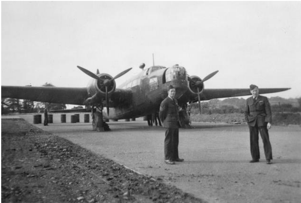
Two members of No. 460 Squadron in front of a Wellington Bomber.

Temporary Sergeant on 6 th January 1942. He joined No. 1 (Y) Depot at Halifax in Nova Scotia on 6 th January 1942 for transfer to England on attachment to the Royal Air Force. He embarked by sea transport from Canada on 24 th January 1942. He joined No. 3 Personnel Despatch and Reception Centre on 10 th February 1942. He joined No. 27 Operational Training Unit at Royal Air Force Station Lichfield on 29 th April 1942. He was transferred to No. 1 Signal School at Royal Air Force Station Cranwell North in Lincolnshire on 11 th March 1942. He joined No. 460 Squadron Royal Australian Air Force at Royal Air Force Station Binbrook in Yorkshire on 17 th July 1942.