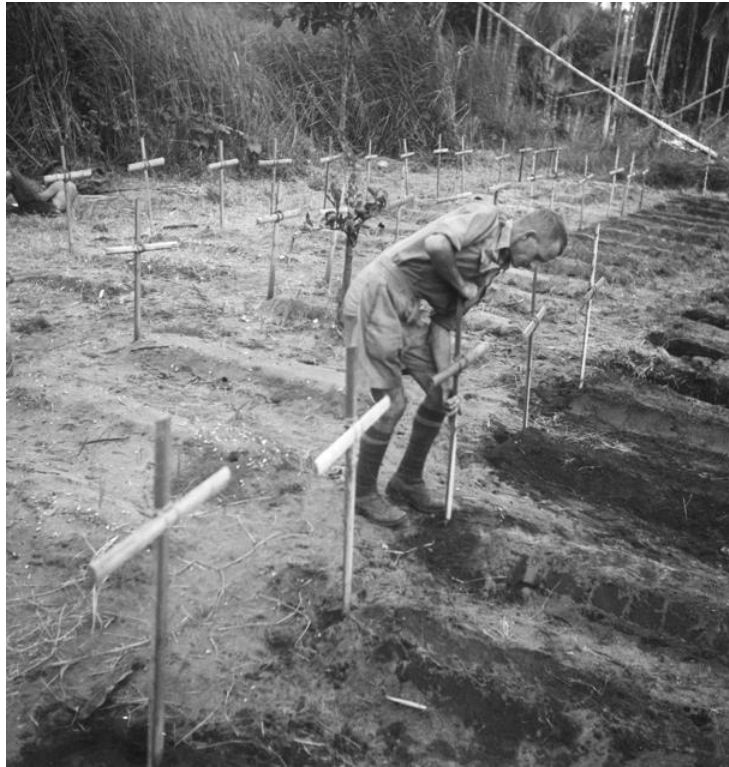
Australian War Memorial photograph 013853

A Church of England Padre pushing a cross into the ground at the head of a grave of one of the soldiers killed during the battle for Gona.