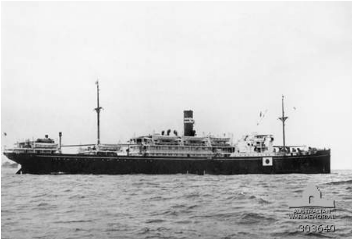
Australian War Memorial photograph 303640 Montevideo Maru