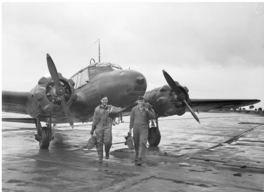
Aircrew of 67 Squadron after a flight in the squadron's Avro Anson aircraft.