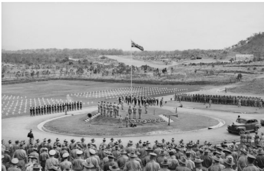
Australian War Memorial photograph NWA0604

The New Guinea Details Depot, Port Moresby. A majority of the 1,000 men in the camp are from New Guinea Hospitals and Convalescent Camps.