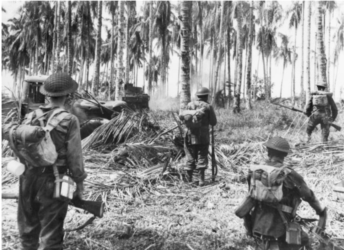
Australian War Memorial photograph 014035 Soldiers of the 2 nd /12 th Battalion stand by as a tank blasts Japanese pillboxes at Giropa Point.