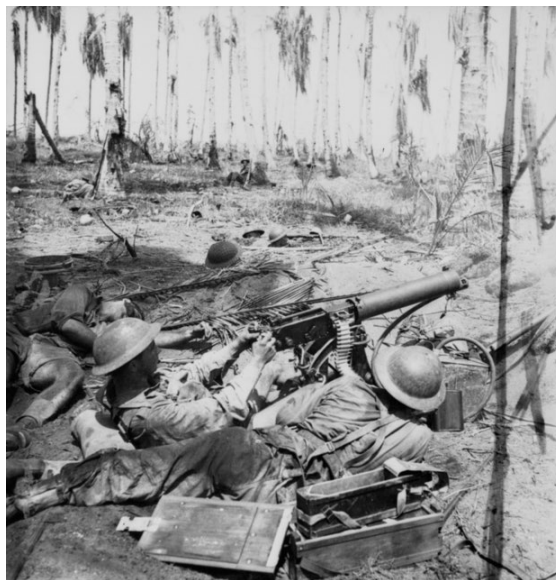
Australian War Memorial photograph 014037 Australian Machine Gunners in action at Buna. The photograph was taken during the fighting and shows a dead Australian of the crew lying on the left.