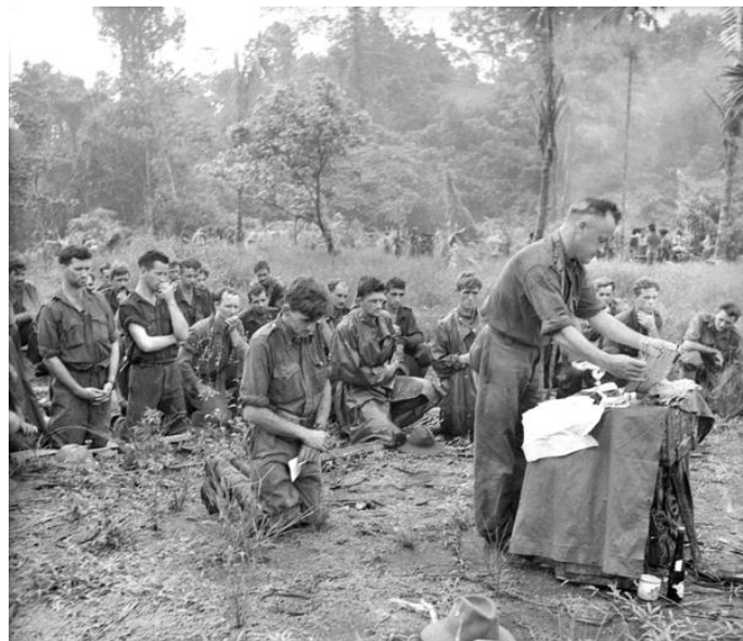
Australian War Memorial photograph 013737